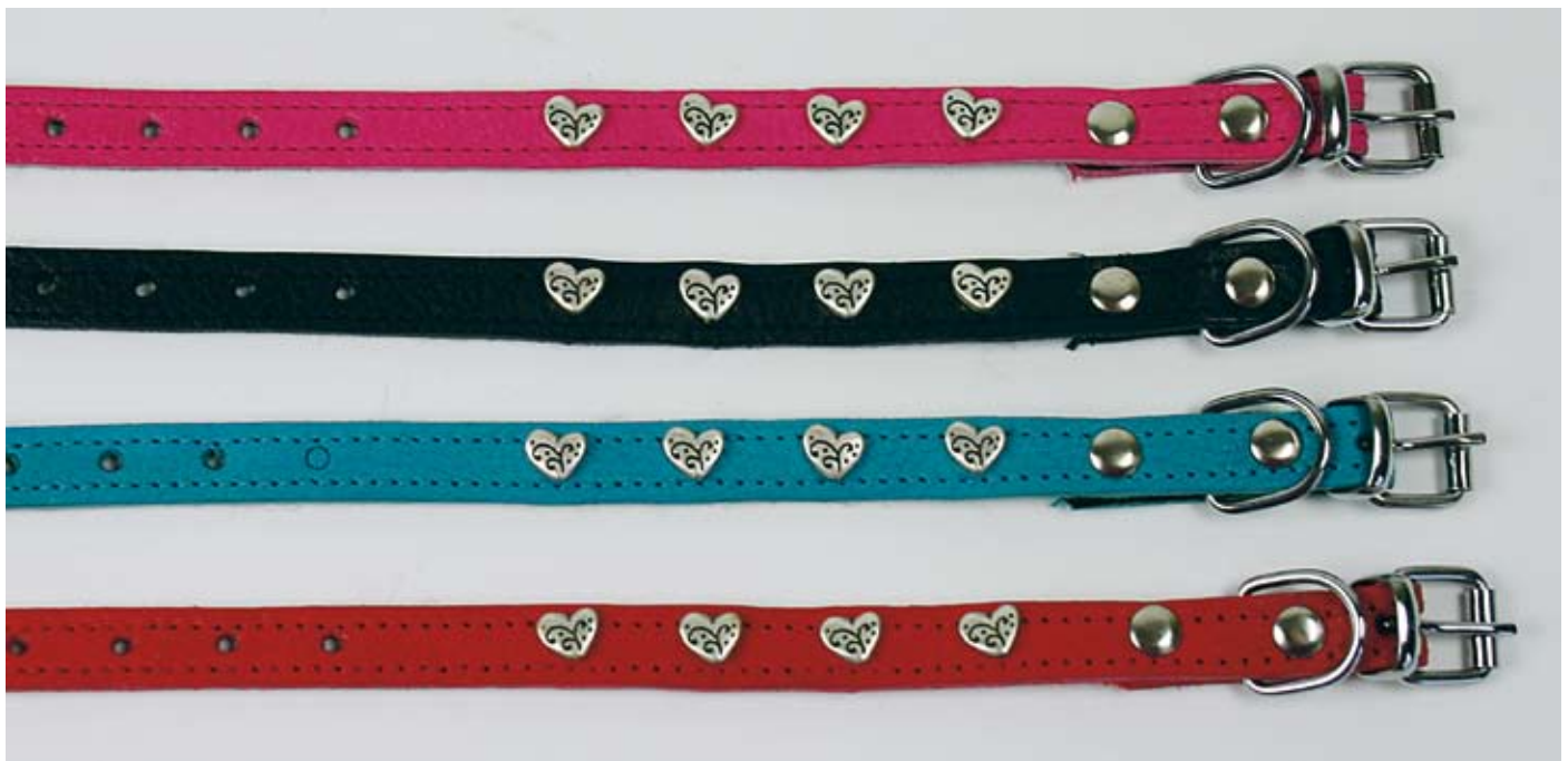
Collars made for puppies and small breed dogs in high fashion colors with exclusive rivits.